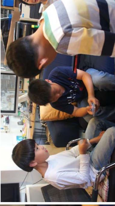
Figure 4: Children playing with the interface. They laugh when collaborative input successfully create highlight sound.

The collaboration will provide more rich social interaction compared with cooperation. However, only a few works provide collaboration. Moreover the works are limited on the body touch interaction. To design the more meaningful social interaction we need to study about co-located social interaction using collaboration.