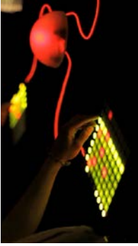
Figure 1: PolyMetros create musical sequence from each pad and result will be combined on the center hardware.

people far apart is getting shorter. In contrast, there is no doubt that the social distance between people who are facing is getting bigger. Rogers calls this phenomenon the digital bubble. The digital bubble is a metaphor of the isolation experienced due to digital technology, especially telecommunication technology[6]. Everyone looks at their cellphones when they are together, and talking is substituted by messengers. In this manner, a number of studies are trying to make the social distance closer through novel interaction technology. Majority of those researches focuses on the system configuration not the user experience of users. To bring more efficient and meaningful social interaction through mobile or wearable device, we need to extract the elements of social interaction in the collocated situation. In our work-in-progress study, we suggest a collocated social interaction through co-playing music by using mobile devices and conduct a user study with children to extract design elements.