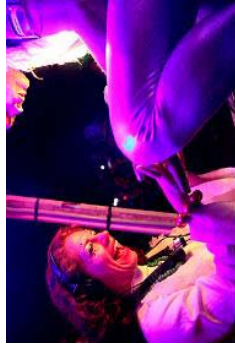
Figure 2: Touchbox provide body touch technology to play a music together.

The difference between the Touchbox and the Polymetros can be explained by differences between cooperation and collaboration. Kirschner et al. explain the difference in cooperation and collaboration[4]. He refers to the American Heritage Dictionary. Cooperation means we worked "together toward a common end or purpose". But collaboration means we initially worked "in a joint intellectual effort". In other words, cooperation is the sum of individual works and collaboration is the initial group works. The interaction method of the Touchbox is collaboration because to create the music, people have to have contact and co-acting. On the other hand, the interaction method of the Polymetros is cooperation, because each user creates their own sequence and the system merges the sound.